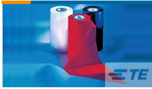
TE Part # 086961-000 T200-RIBBON-WH-4HT